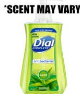
*SCENT MAY VARY Dial Liquid Hand Soap 22-33749/ 22-34851 7.5 oz: $3.83