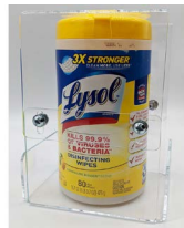
Corona Guard Adjustable Sanitizing Wipes Holder 22-34694 $52.50