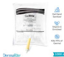
DermaRite Hand Sanitizer Gel Refill Bag for Wall Dispenser Hand Sanitizer Gel Refills $8.50