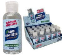
Clean Hands Hand Sanitizer 22-34931 2 oz 24pk: $11.28