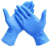
Nitrile Gloves, M, L, XL 22-34201, 22-33740, 22-33762 100 Gloves/Box: $17.50