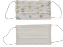
3 Ply Mask for Children, 50pk 22-34658 $26.99