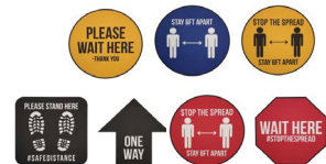
Floor Decals 14-34475 to 14-34481 $7.50