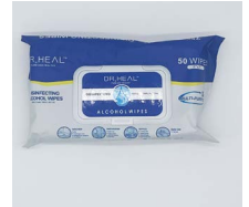
Dr. Heal Disinfecting Alcohol Wipes, 50 Count 22-34995 $2.25