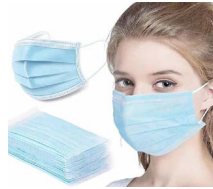
3 Ply Face Mask, 50pk 22-33578 $6.65