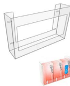
Corona Guard Acrylic Gloves Dispenser 22-34693 $35.00