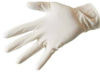
Nitrile Gloves, M 22-34985 M 200 Gloves/Box: $39.99