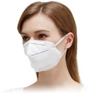
KN95 Face Mask KN95 Mask 10pk/40pk 10 pk: $19.74 40 pk: $30.75