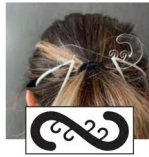
Corona Guard Comfort Clips 22-34695 $1.00