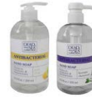
Dead Sea Collection Antibacterial Hand Soap Antibacterial Hand Soap, 16.9oz 16.9 oz 6pk: $11.10