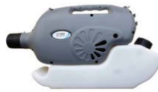
ULV Cold Fogger C100+ ULV Cold Fogger C100+ $650.00