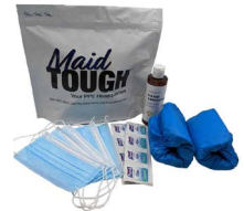
Real Estate Home Showing PPE Kit Real Estate Home Showing PPE Kit $19.99