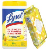
Lysol Wipes 22-33580 80 Count: $15.11