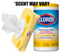
*SCENT MAY VARY Clorox Disinfecting Wipes 22-33785 75 Count: $13.40