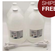
SHIPS FREE Gallon Hand Sanitizer, 4pk 22-34678 $75.29