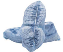
Shoe Covers, One Size, 100pk 22-33841 $32.02