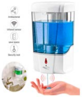
Automatic Wall Mount Hand Sanitizer Dispenser 700ML Automatic Soap Dispenser $50.00