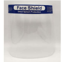
Disposable Face Shield 22-33830 $1.99