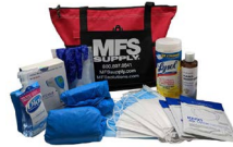
Multifamily Home Showing PPE Kit 22-34929 $96.99