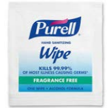
Case Pack = 300 Purell Individually Wrapped Hand Sanitizing Wipes, 300pk 22-34263 $83.00