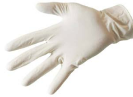
Nitrile Gloves, Large 22-33848 200 Gloves/Box: $35.00